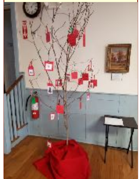
The Giving Tree (above) lets everyone participate in the joy of the season.