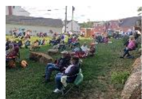
A recent concert held at the Garden Sanctuary sponsored by our church and the Community Center drew 70 people. It was well worth it.

amazing green salad, chips, cookies, watermelon slices, and lemonade – and our Shelter friends loved it! So, we did it again – exactly the same! Well, sort of — both this August meal, as well as the one we provided last