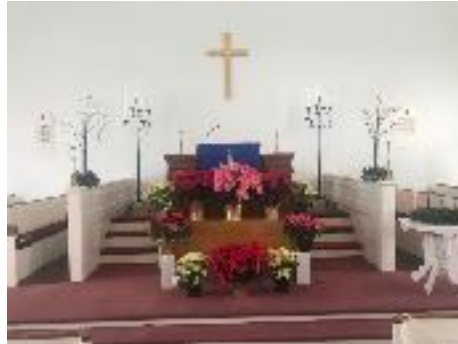
➡ The poinsettias, given in memory of loved ones each Christmas, were placed between gently lit twigs, with little red cardinals hanging in them.

We have faith in each other and know we will all adjust to what's needed to keep each other safe.